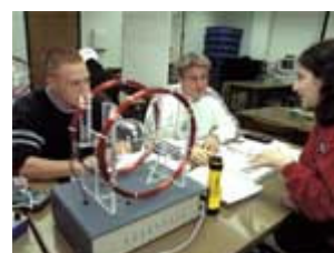
TAs in instructional labs