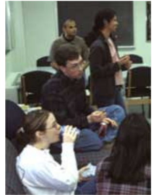
Students in Commons Room

Students holding a 25% or greater teaching or research assistantship appointment will be assured a tuition scholarship. The tuition scholarship for academic year 2009-2010 is $5,230. The tuition scholarships will be applicable only for the academic year and does not include scholarships for summer semester enrollment. These rates for the tuition scholarship are based on a 9 s.h. or greater registration and will be pro-rated as related to each student's registration. The tuition scholarship is not affected by the level of appointment above 25%.